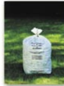
1 er jour